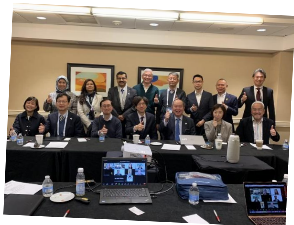
EXCO Meeting at the ASN Kidney Week in Philadelphia on 2 Nov 2023