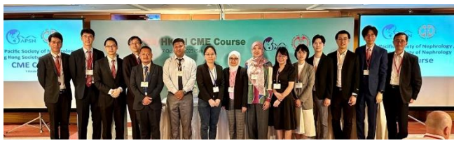
Group photo with CME awardees and faculty at the APSN-HKSN CME Course held on 7 Oct in Hong Kong