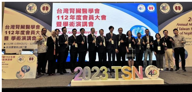
Group photo with CME awardees and faculty at the APSN-TSN CME held on 10 Dec in Taipei

Our CME activities have continued to be active throughout 2023. We have held joint APSN-host society symposia for 7 of our 8 Sponsoring Societies. From 2024, APSN will engage 4 Societies per year so that each will organise this symposium every other year to avoid overloading. Our webinars have continued to be popular including one on paediatric nephrology and one on HIF1- \alpha stabilisation with ~4800 online participants. In addition, the CME Committee has helped to shape the scientific program in the emerging Nephrology Society in Vietnam.